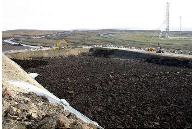
Peat store lined with Pozidrain being filled

Pozidrain and Erosaweb have a 120 year design life, so performance is assured far beyond the anticipated operational life span of the SGP.