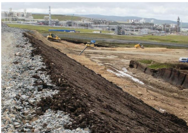
Peat filled Erosaweb provide natural finish on steep slopes

ABG provided design and technical support, enabling the designer to propose the most cost effective build solution.