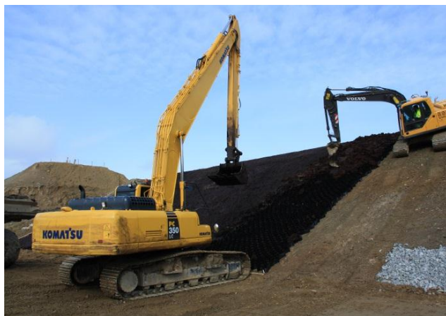
Installation and filling of Erosaweb GWX on 1:2.5 slopes

Contact ABG today to discuss your project specific requirements and discover how ABG past experience and innovative products can help on your project.