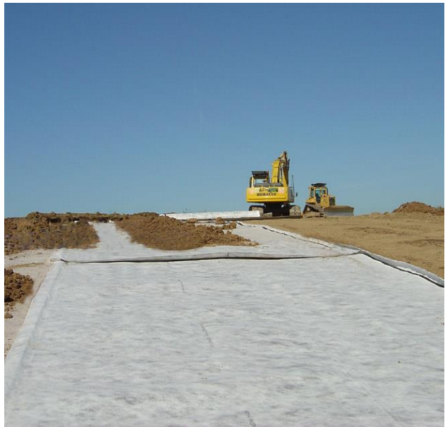
Large rolls enabled rapid installation

ABG provided design assistance. This included slope stability and flow capacity calculations.