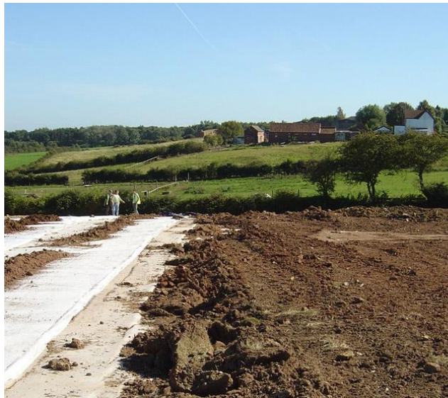
High flow capacity in all directions

Contact ABG today to discuss your project specific requirements and discover how ABG past experience and innovative products can help on your project.