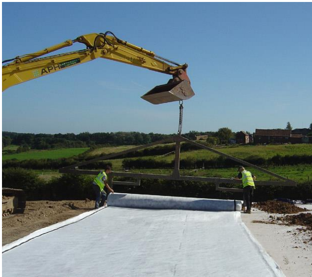
Flat selvedge ensured easy overlapping and jointing