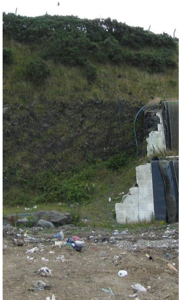
Steep Wall with lining system

Contact ABG today to discuss your project specific requirements and discover how ABG past experience and innovative products can help on your project.