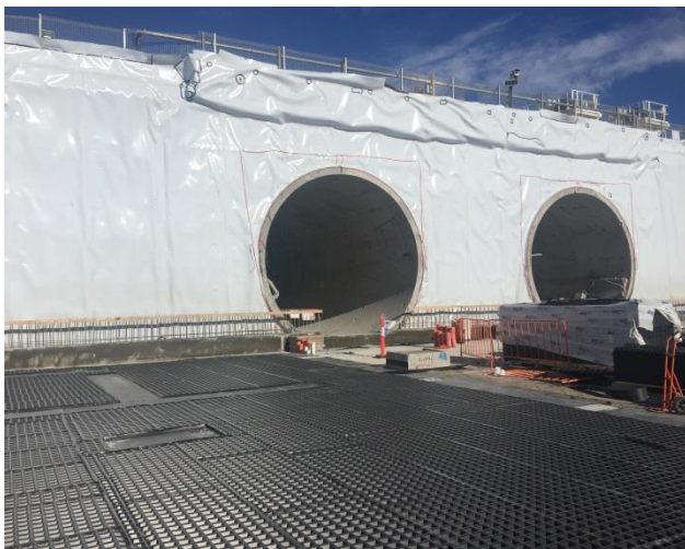
Installed panels of Cavidrain ready to receive concrete