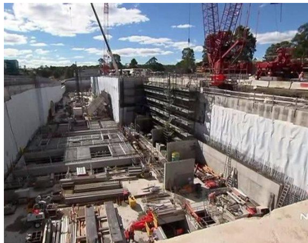
Ongoing construction after casting of floor slab

Contact ABG today to discuss your project specific requirements and discover how ABG past experience and innovative products can help on your project.