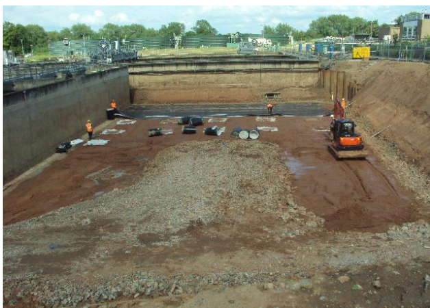
Placing Deckdrain with its geotextile facing down and the impermeable cusped face up ready to receive poured concrete

ABG provided calculations to show equivalency of flow to stone drainage and gave installation guidance on site.