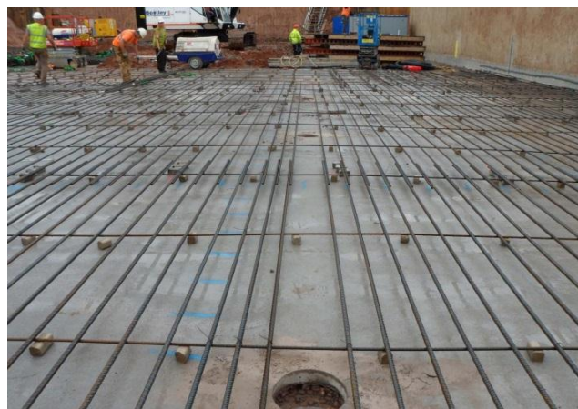
Reinforced floor slab preparation showing a valve position

Contact ABG today to discuss your project specific requirements and discover how ABG past experience and innovative products can help on your project.