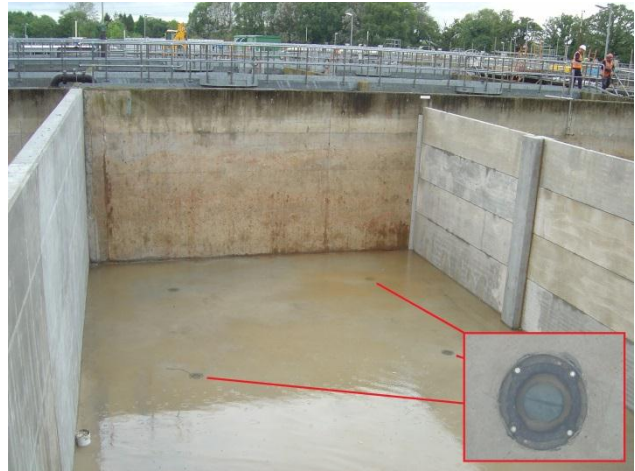
The finished floor slab with non-return valves for groundwater pressure relief when the tanks are empty

ABG Deckdrain 700S/NW8 was proposed to perform the dual function of uplift pressure relief and under-slab drainage. The virtually impermeable cusped core of Deckdrain is supplied thermally bonded to a filtration geotextile to prevent soil fines from blocking the drainage path. Deckdrain is placed facing down and an initial screed layer is poured in to the cusps. The cusps are filled with the screed, bonding it to the underside of the slab and enhancing the compressive strength. Deckdrain's open core structure far exceeds the drainage capacity of a 500mm stone. Removal of the stone provided significant savings in excavation, and the import and placement of costly granular materials. Non-return valves were placed at intervals across the floor slab to relieve groundwater pressure when the tanks are empty thus avoiding uplift pressures and allowing the minimum practical concrete floor slab thickness.