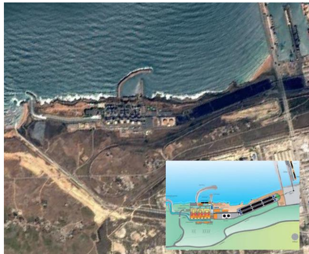
Finished facility with no leachate entering the environment

Contact ABG today to discuss your project specific requirements and discover how ABG past experience and innovative products can help on your project.