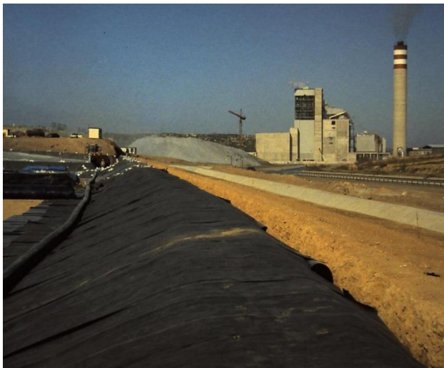
Anchorage details around the perimeter of the facility

The specially selected filter geotextile on the ABG Pozidrain drainage geocomposite had to filter the high proportion of fine particles in the coal combustion residues produced from the coal fired plant