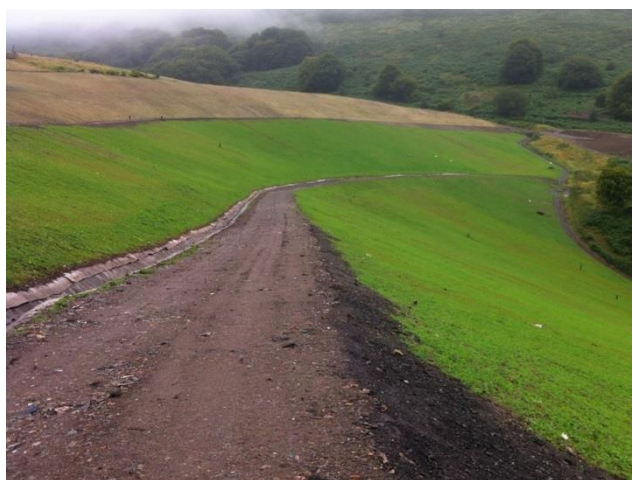
Finished, permanently stable, aesthetically pleasing green slope

Contact ABG today to discuss your project specific requirements and discover how ABG past experience and innovative products can help on your project.