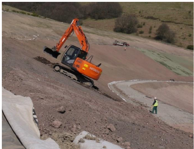
Proving high friction as construction traffic spreads cover soil whilst protecting the geomembrane

ABG proposed the system and provided design and site specific laboratory test results. Site support during the construction and timed deliveries ensured a successful construction.