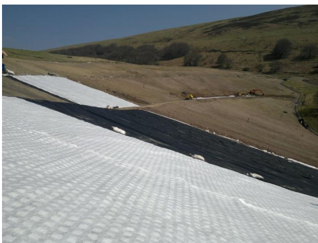
Pozi G with drainage in all directions placed on top of 1mm LLDPE textured liner with