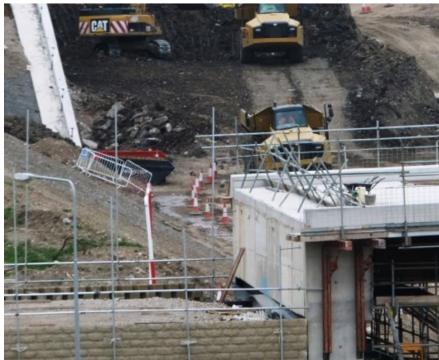
Deckdrain used in tight backfill operating locations

Contact ABG today to discuss your project specific requirements and discover how ABG's past experience and innovative products can help on your project.