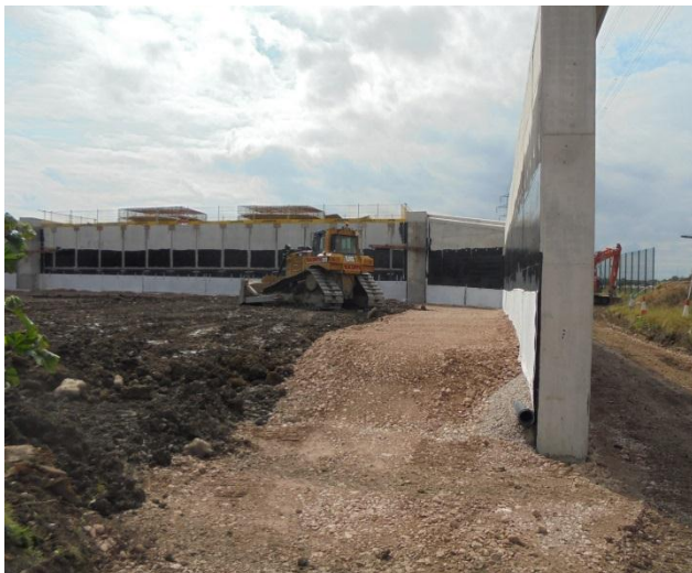
Deckdrain protects the waterproof layer during backfill operations (drainage blocks damage the layer)