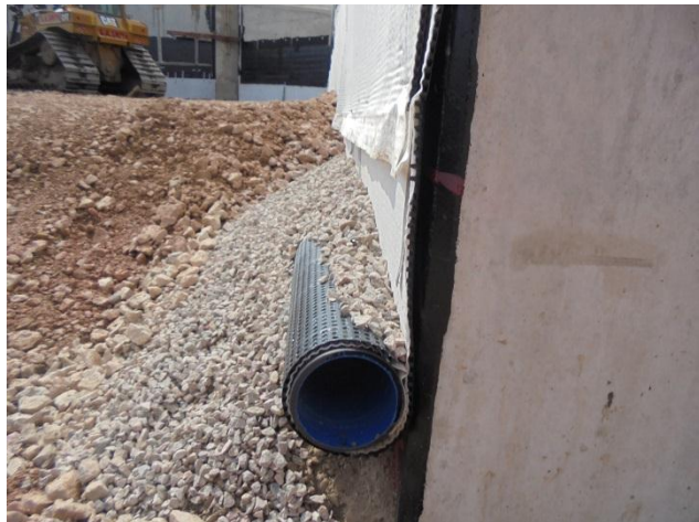
Deckdrain is easily attached to the wall with the lower end wrapped around the perforated drainage pipe.

ABG made timed deliveries with target quantities to different locations along the project. The County Council approved the Deckdrain which also has BBA Approval for use in Highways applications.