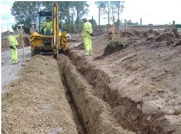
Minimum excavation using narrow trenching bucket