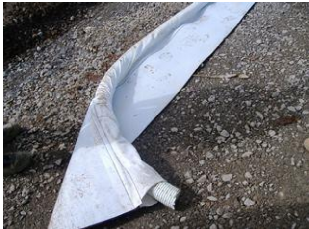
ABG Fildrain composite with integral sock to allow the threading of a perforated pipe ready for installation

Assistance with cost comparisons and provision of staged delivery to suit this narrow corridor site. Supplied relevant documentation to assist with approvals.