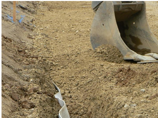
Backfill by simply pushing and compacting fill next to ABG Fildrain Type 6

Contact ABG today to discuss your project specific requirements and discover how ABG past experience and innovative products can help on your project.