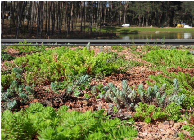
Mature sedum plants following a maintenance visit from Geogreen