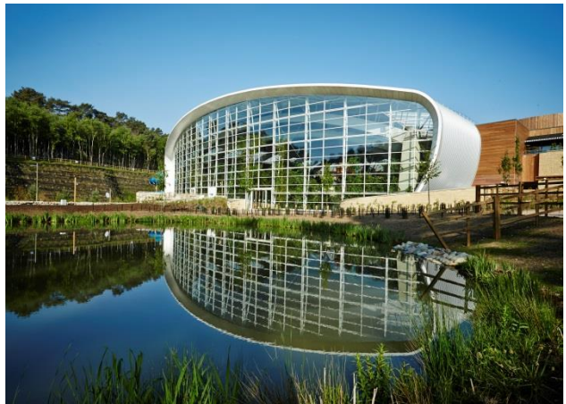
The prestigious Woburn Center Parcs main hall and water sports centre

Contact ABG today to discuss your project specific requirements and discover how ABG past experience and innovative products can help on your project.