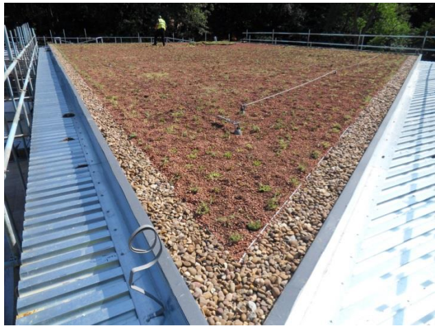
The Pancake House Newly planted sedum plug plants in ABG Growing Media bordered by profiles separating it from a ballast edging

ABG designed the detail of the system including careful selection of plant species to blend with the local environment.