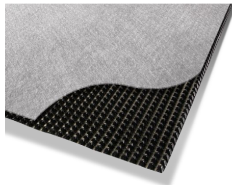
ABG Pozidrain Geocomposite