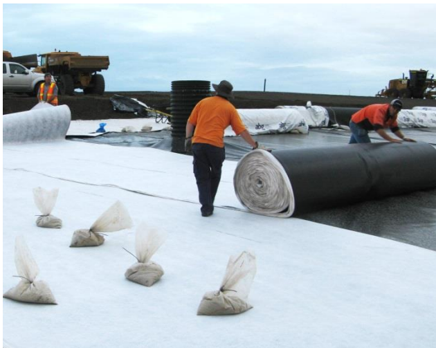
Large rolls butted together on top of the geomembrane with a geotextile overlap at the edge ready for tack welding

Site simulation testing showing the superior void spanning ability of ABG Pozidrain over a typical geonet core drainage composite