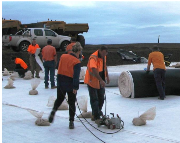
Tack welding of the geotextile overlap with a Leister gun to ensure that the rolls remained in place whilst backfilling

Contact ABG today to discuss your project specific requirements and discover how ABG past experience and innovative products can help on your project.