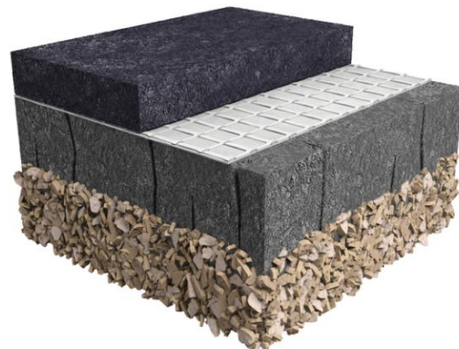
ABG Rotaflex 830SL