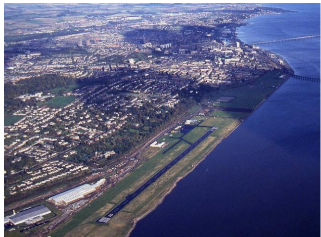
Airport on reclaimed land serving Dundee.

Contact ABG today to discuss your project specific requirements and discover how ABG past experience and innovative products can help on your project.