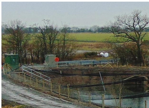
Remote site over 1km from nearest road, with access across fields

Contact ABG today to discuss your project specific requirements and discover how ABG past experience and innovative products can help on your project.