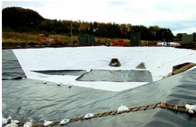
Pozidrain under the liner provides drainage, gas venting and puncture protection

ABG provided detailed technical support to ensure sufficient drainage capacity, while protecting the liner and checking slopes remained stable.