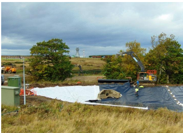
Remote site meant importing material would be expensive and environmentally damaging