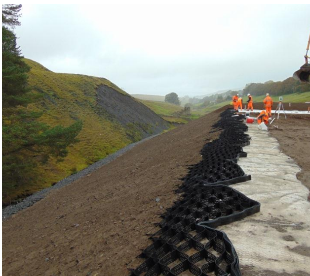
Erosaweb panels providing soil veneer reinforcement