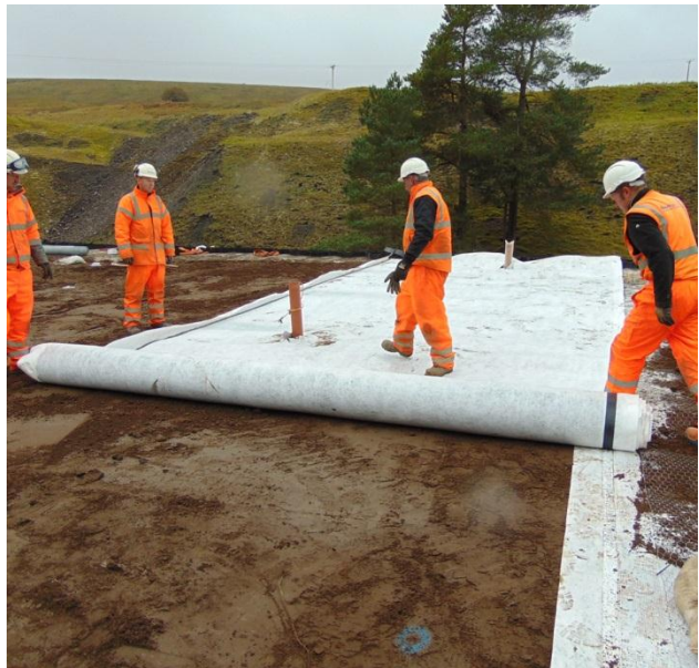
Wide width rolls enabled rapid installation and minimised the number of joints

ABG provided design assistance, including slope stability and flow capacity calculations.