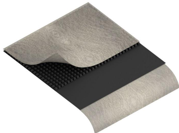
ABG Pozidrain SKL