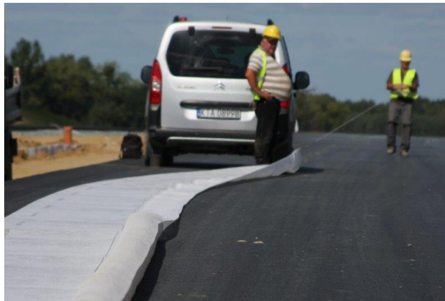
The pipe was pulled through the sleeve using the integral draw string provided

In close cooperation with Geotica, ABG provided a technical solution and the requested data to achieve approval for the product. Fildrain was manufactured at a bespoke width and pipe sock diameter and delivered to site for easy and cost-effective installation.