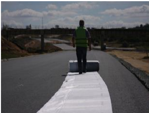
One 50m roll of Fildrain is equivalent to 20 m 3 of stone and is easy to install