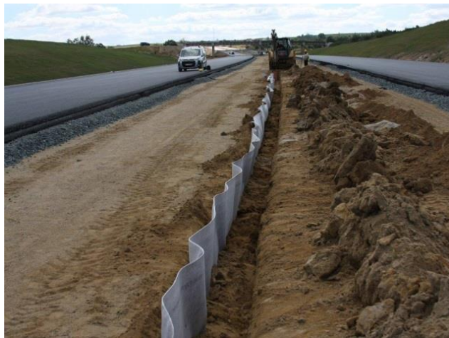
Fildrain and pipe placed in the trench and backfilled with the excavated material. No material to landfill

Contact ABG today to discuss your project specific requirements and discover how ABG past experience and innovative products can help on your project.