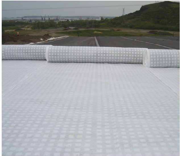
Wide-width rolls enabled rapid installation

This landfill cap was completed without any stability problems and drainage performance was reported to be adequate on this 6ha landfill cap.