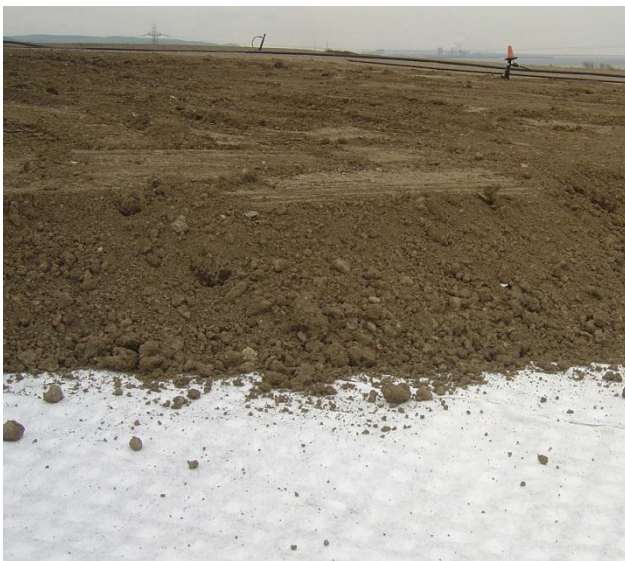
High flow capacity in both directions

ABG provided design assistance. This included shear box testing, slope stability and flow capacity calculations.