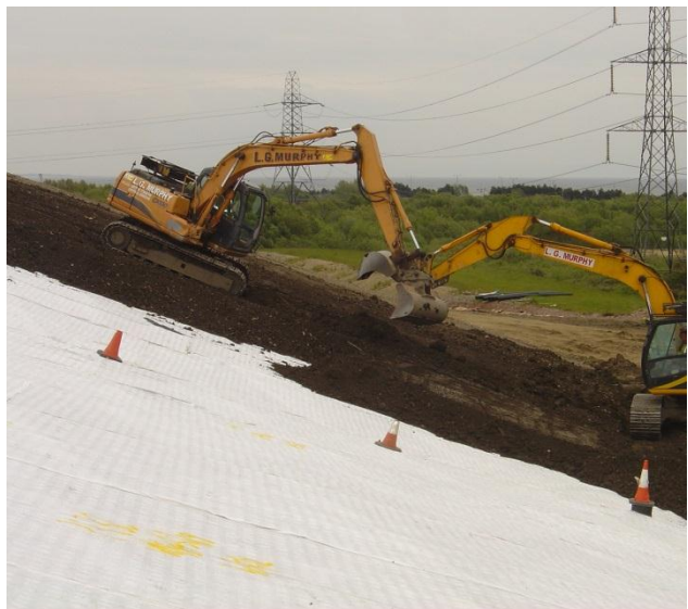
Superior interface friction ensured 1 in 3 slope stability

Contact ABG today to discuss your project specific requirements and discover how ABG past experience and innovative products can help on your project.